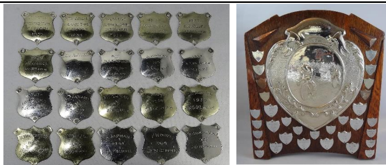
Fastest Average Speed - Best All Rounder