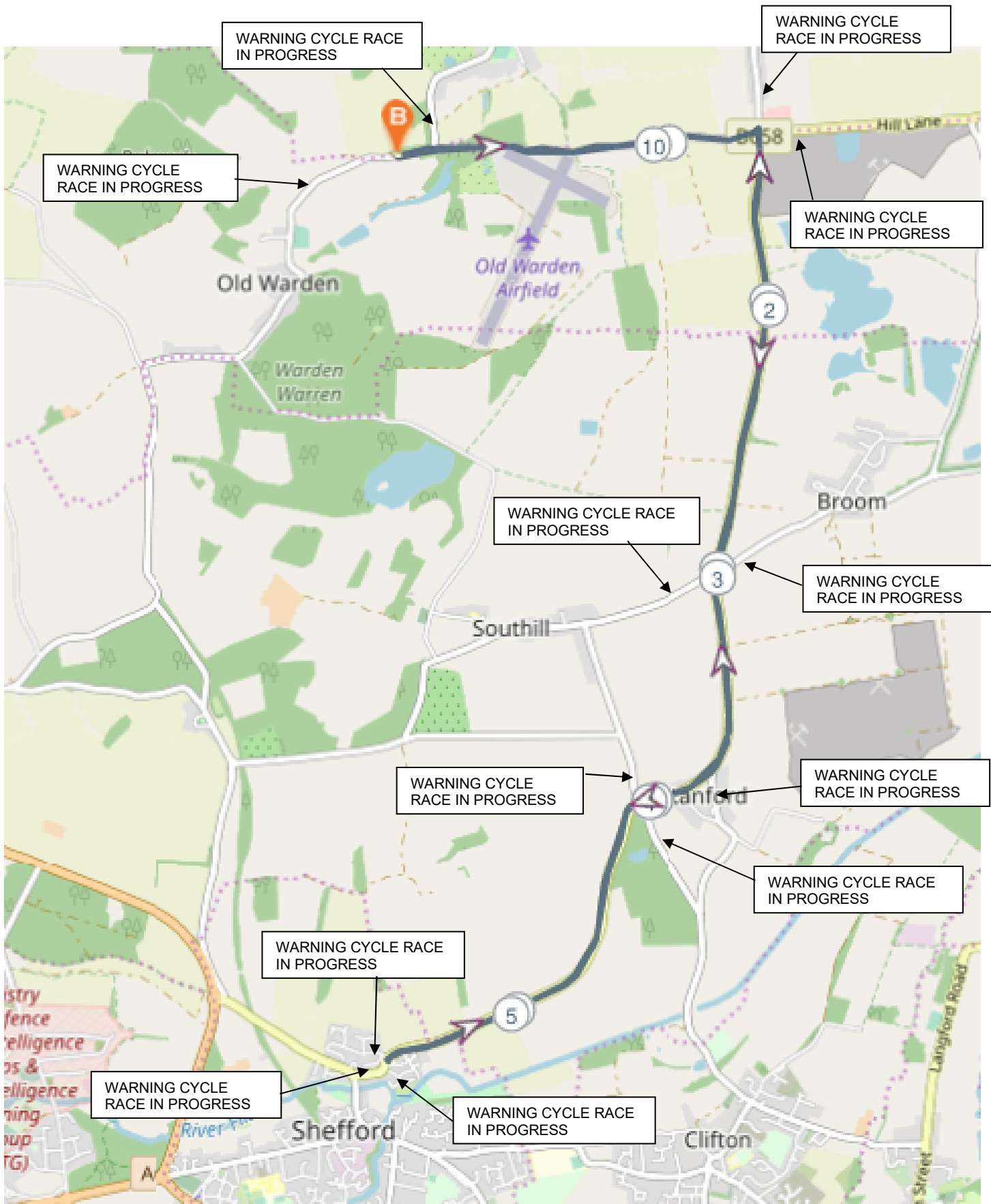
F1/HNCC/X11 SIGNAGE PLAN