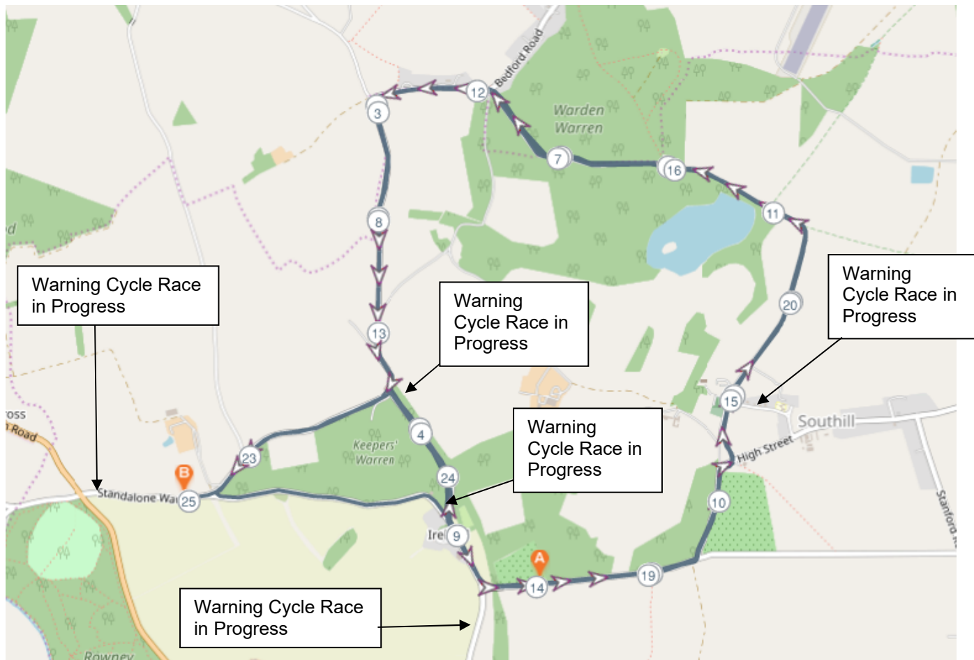
F1/HNCC/X25 SIGNAGE PLAN